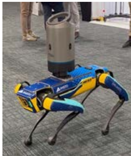
Robot – used to find radioactive material.